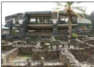
Ancient Capernaum, Israel

Peter and his wife lived on the NW shore, in a fishing village called Capernaum. [kuh-PUHR-nay-uhm] Convincing evidence, dating back to the 2nd century, actually shows which house is theirs.