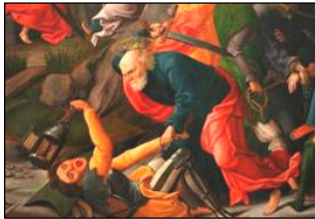
The Capture of Christ, circa 1520

If ever there was a model of total surrender and passionate, undivided devotion, it's Peter. Remember when he took off a guy's ear with a sword? This time he does it with a pen!