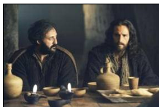
Peter and Jesus from "The Passion"

He doesn't expect spotlessness, just head-over-heels surrender. And, He certainly doesn't expect us to be blameless; no matter how good our intentions might be. Remember on the night of Jesus' betrayal?