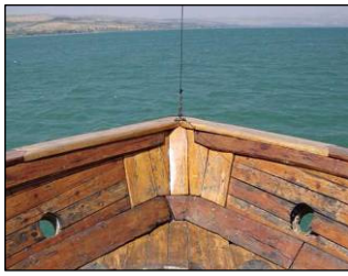
Wooden boat on Sea of Galilee

Wow. When you can make Jesus call you the devil, that's something! And yet, it doesn't in any way diminish His devotion to Peter. Jesus is very aware of who can walk on water and who just sinks.