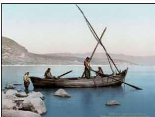
Sea of Galilee, Photochrom c. 1890

Peter is exhausted from fishing all night and catching nothing.