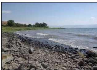
NW Shore of the Sea of Galilee

Peter has zero tolerance for anyone who discredits, corrupts, compartmentalizes, or compromises the Gospel. From day one, he had literally dropped everything and devoted himself to Jesus.