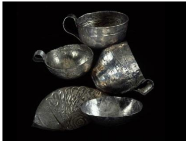
4,000-year-old Silver vessels

The royal cup was most likely silver, because in the 12th Dynasty, silver was more precious than gold. And it seems Senusret's father (Amenemhat II) used silver cups as royal gifts. In fact, under a temple to Montu, a falcon-god of war, Senusret's dad buried about 150 silver cups. And in 1936 they were discovered. 4