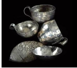
4,000-year-old Silver vessels

Joseph's feast for his unaware brothers has ended. But, his test for 'em has just begun. He hid their silver in their grain sacks, and the cup they think has magical power is in Benjamin's bag.