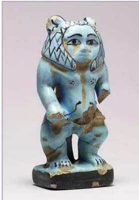
Bes, c. 1800-1750 BC

Ancient Egyptians excelled in the worship of gods, goddesses, and rulers considered to be demigods ( partly god). This is Bes, an Egyptian idol of protection from the Middle Kingdom, Joseph's day. Do you know the difference between idol worship and worshipping the God of Joseph? Idols are always and only served as a means of getting something, which makes all idol worship, self-centered . This is the opposite of what Jesus came to accomplish.