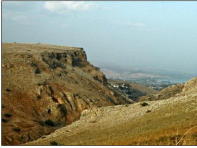
Mount Nitai; most likely, Nazareth

Just before Jesus moved to Capernaum, he went to Nazareth and showed His old friends and neighbors how He was the fulfillment of scripture who would usher in God’s Kingdom. And they promptly ushered Him to the cliffs of Nazareth to throw Him to His death. Spoiler alert: they weren’t successful.